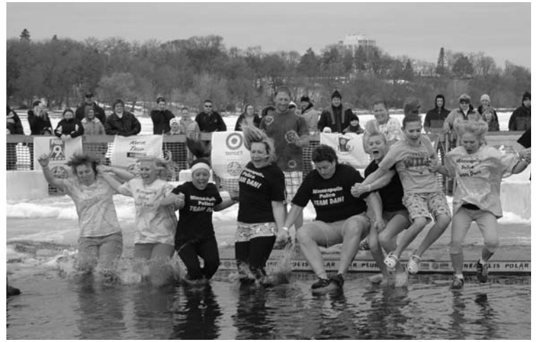
MPD Plungers -not in any special order...